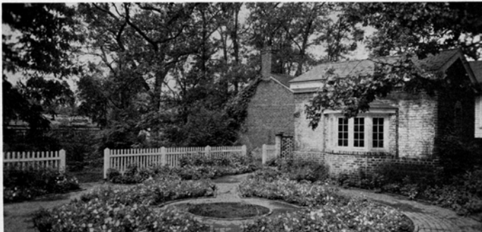
This garden in front of the new museum of the Garden Club of Georgia is in the process of making. A sundial is to be surrounded by four beds, each featuring a Georgia product done in boxwood—a watermelon, a peach, a cotton boll and a Cherokee rose.