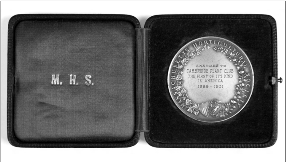
Medal presented by the Massachusetts Horticultural Society in 1931 to the Cambridge Plant Club in recognition of being “the first of its kind.”

Gradually, the club added civic planting to its portfolio of interests. In 1917 it undertook its first planting projects: adding beds of bulbs to brighten “the otherwise gloomy surroundings of the playground” at the Margaret Fuller House in East Cambridge, as well as children’s “war gardens” in a nearby field. In the 1920s it turned its energy to Cambridge Common, which had lost many trees when it was used as a site for military barracks during World War I. First, trees were planted; then, a twenty-year project designed to screen parked cars with a shrubbery border followed.